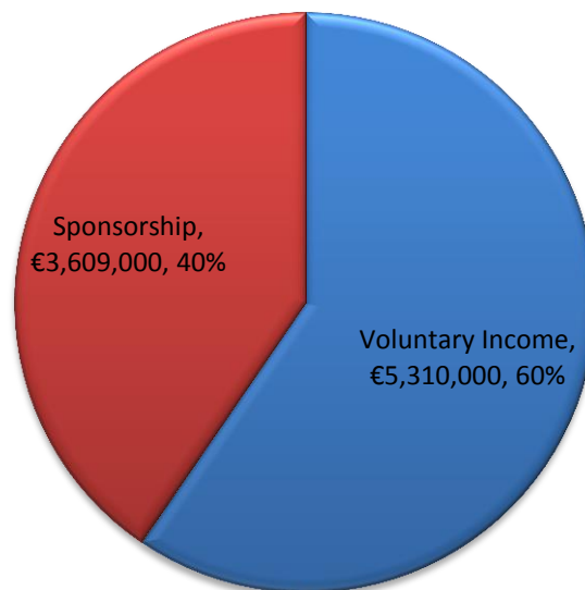
Figure 2.1 – Private Investment Received, 2014

Total private investment in 2014 amounted to €8,919,000. The graph below presents the split of total private investment reported between sponsorship and voluntary income, with voluntary income representing the majority of receipts.